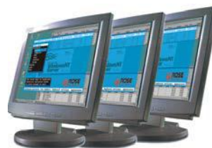
Drive multiple monitors From 1 or 2 computers

The VideoSplitter is rack mountable with optional 19", 23", and 24" rack mount kits.