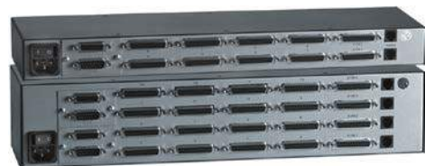
Rear view of UltraMatrix E-series, 2x8 (top), 4x16 (bottom)