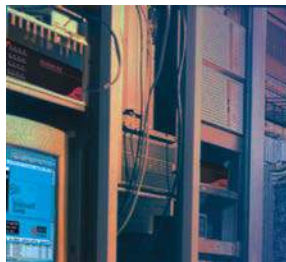
Perfect for server rooms

Once you install the UltraMatrix its value increase since it has flash memory. Firmware updates are available from rose.com . This ensures your product will be compatible with the newest products and technologies. Call us today for more information on this and other Rose products.