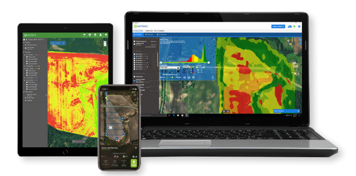
FieldAgent Web, Mobile, and Desktop

The FieldAgent Platform is a complete agricultural data analytics solution that provides deep, actionable insights. Coupled with a Sentera AGX710 Gimbaled Sensor, FieldAgent takes you beyond aerial photos into meaningful data products with actual economic value. Sentera analytics around stand and emergence, variability, biomass, nutrition, pest, weed, and disease status are compatible with AGX710 imagery.