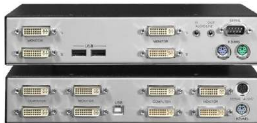
CrystalView Quad DVI CATx (Serial / Audio option shown)