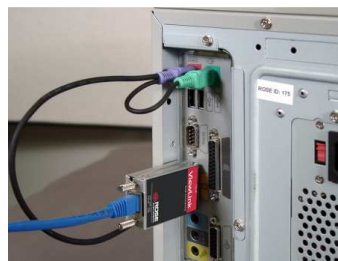
Connect the transmitter directly to a PC's Video, keyboard, and mouse ports