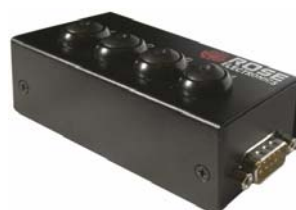
Instantly switch to a CPU port with the push of a button

Operations are made easy by using the push button features of the RCS system.