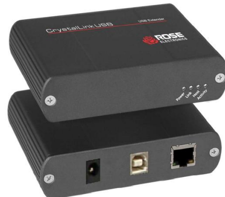
Transmitter Unit (front and back)