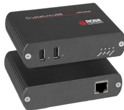
Receiver Unit (front & back)