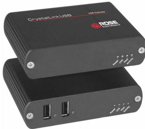
Part Number CLK-2U2TP-100M