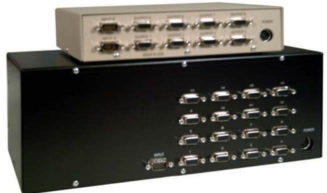
VSP-2X8VB model (top) / VSP-1X16VB model (bottom)