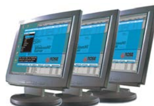
Drive multiple monitors From 1 or 2 computers

The VideoSplitter is rack mountable with optional 19", 23", and 24" rack mount kits.