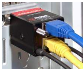
Connects directly to a PC's Video, keyboard, and mouse ports