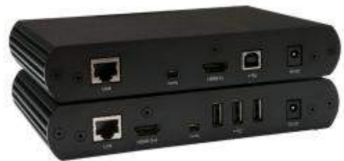
Transmitter (Top) and Receiver (Bottom)