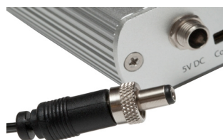
Locking Power Connector