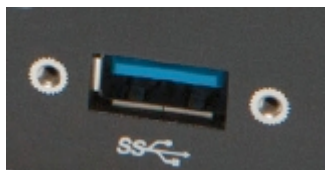
Locking USB Connector

Fiber optic cable should be either OM2 (50/125µm) for non-camera applications at 50 metres, or OM3 (50/125µm) for USB3.0 camera operation at 100 metres.