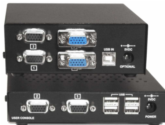
Rear view Local / Remote units Dual Video