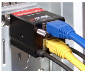
Connects directly to a PCs Video, keyboard, and mouse ports