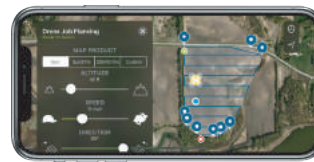
FieldAgent Mobile - Autonomous Flight

Using the mobile app, select your field boundary, map type, and let FieldAgent do the rest! FieldAgent will automatically fly your DJI drone in a precise pattern and command your sensor to capture data in all the right places.