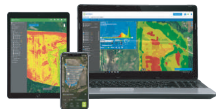
Highly Precise, Actionable Plant Health Data