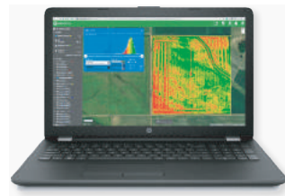
FieldAgent Web - NDVI Orthomosaic + NDVI Toolbox Capability

FieldAgent offers a variety of analytic products, enabling detailed analysis of your field - including plant populations, weed locations, and data to assist with variable rate prescriptions creation. Explore the NDVI Toolbox® and dynamically re-color and re-map results. Then, turn analysis into action by exporting data directly to your machinery as shapefiles or rate-controlled prescriptions.