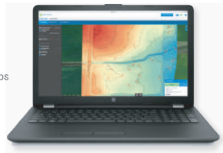
FieldAgent Desktop - Elevation Maps