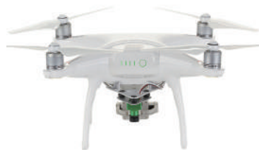
Precision scouting tool